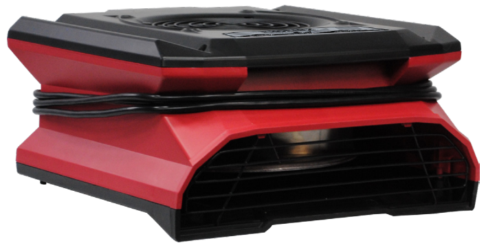
Phoenix 50Hz AirMax PN 4035800

With its Patent Pending, low resistance motor support bracket and optimized outlet shape, the Phoenix 50Hz AirMax delivers airflow of over 1274 m 3 /hr (750 CFM). This gives you high velocity air over a 25% larger area than other low profile air movers. In addition, the Phoenix 50Hz AirMax is stable on all 5 sides for maximum flexibility to position and direct the drying.