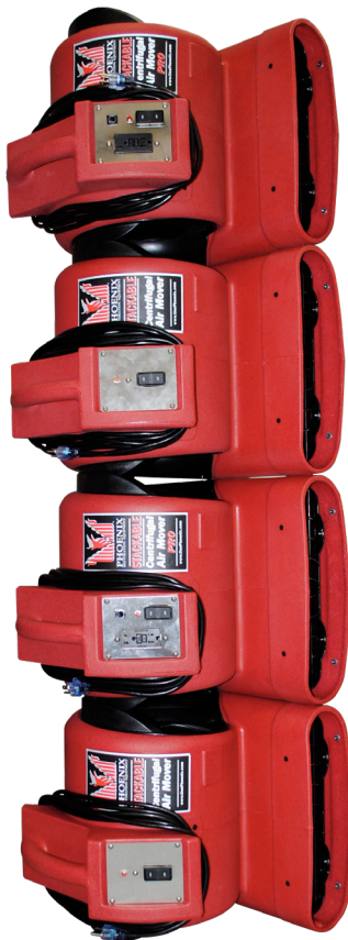
PNs 4032280 and 4032280 are pictured to demonstrate maximum stackability.

WARNING: Disconnect the unit from power before servicing or cleaning. Replace the safety grill after servicing or cleaning.