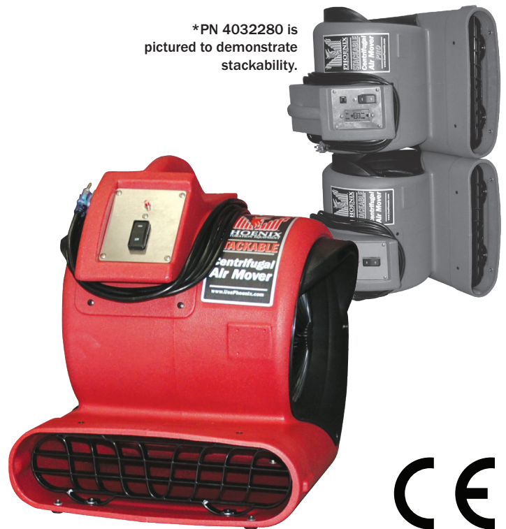
Phoenix Stackable Centrifugal Air Mover PN 4032280

*PN 4032280 is pictured to demonstrate stackability.