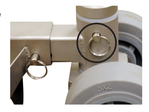
Figure 2: Remove the hitch pin to steer the Hydro-X during extraction

To steer the Hydro-X Xtreme Xtractor, remove the middle hitch pin on the wheel/base assembly. When finished extracting, moving or transporting the Hydro-X, be sure to reinstall the hitch pin.