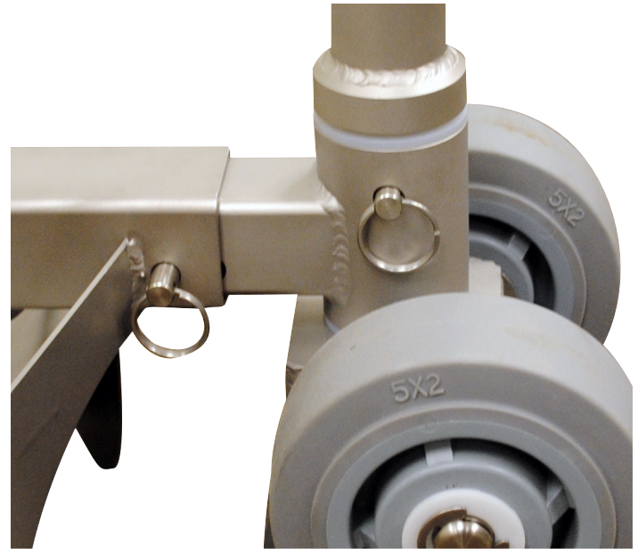
Figure 1: Tube and receiver connections secured by hitch pins