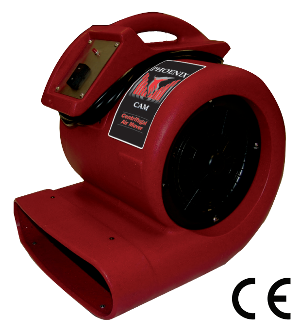
Phoenix Centrifugal Air Mover 50Hz PN 4027620

Specifications subject to change without notice.